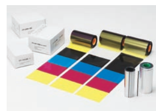
Ink Ribbon & Retransfer Film

*CX-D80 series is prohibited to export/re-export to Cuba, Iran, North Korea, Sudan and Syria by Export Administration Regulations of USA.