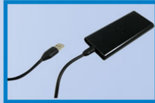
PK-UHF-8002R USB type portable reader