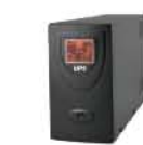
◀ Power supply and linkage interface