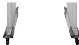
◀ Universal wheel