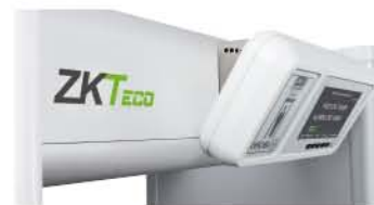
◀ Metal bracket