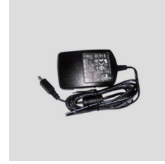
Adapter AC Cable