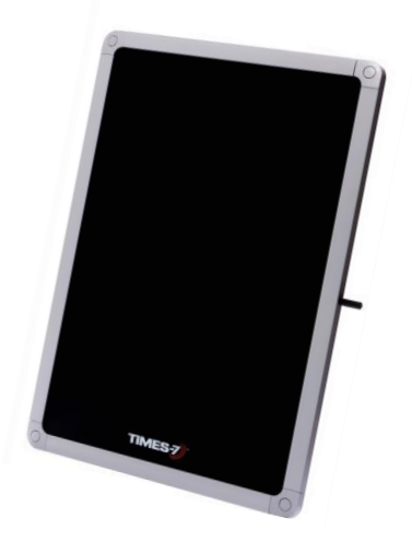
The SlimLine A6032