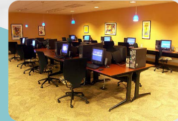
Time and Attendance