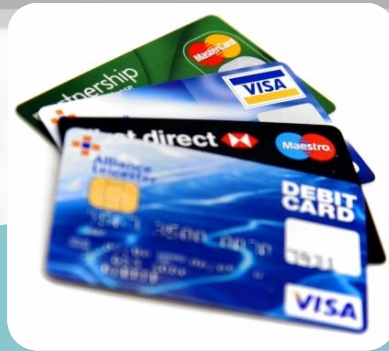
Payment System (e-Purse, etc.)