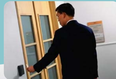
Physical Access Control